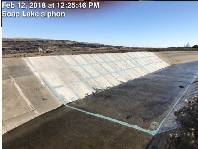
Feb 12, 2018 at 12:25:46 PM Soap Lake siphon

220 gallons of AquaLastic ® Applied by QCBID crew